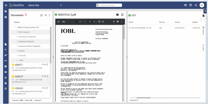
General Document View